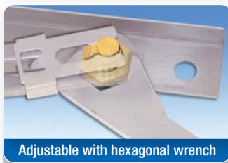
Adjustable with hexagonal wrench