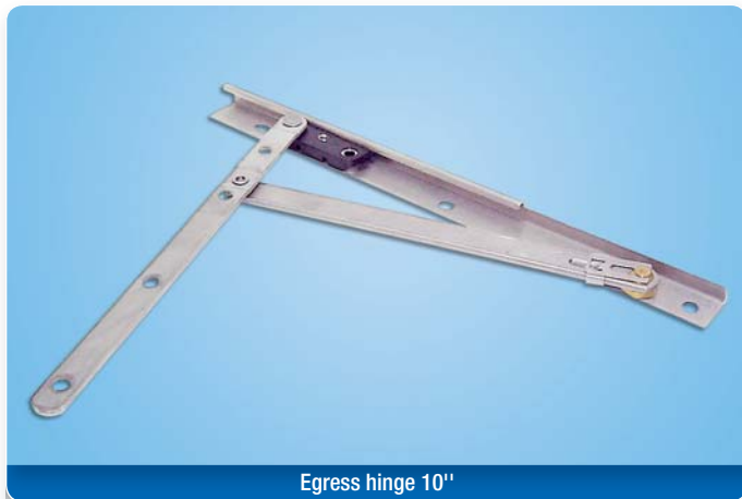
Egress hinge 10''