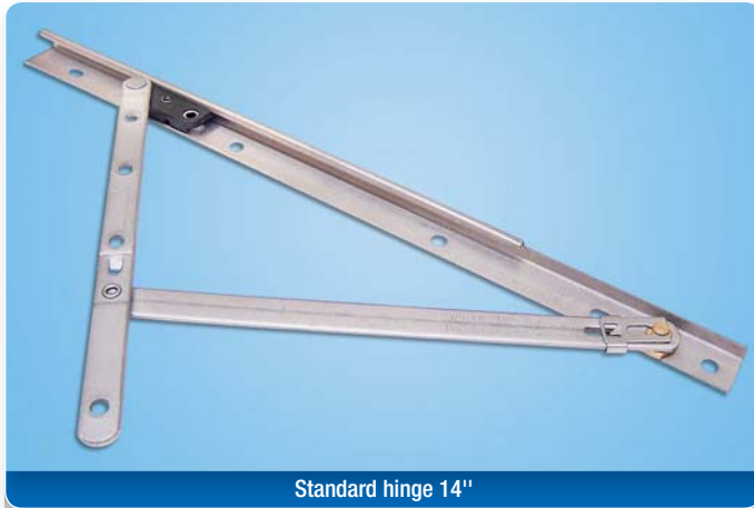
Standard hinge 14"