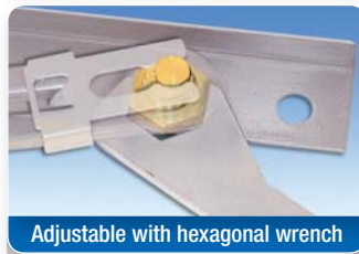
Adjustable with hexagonal wrench