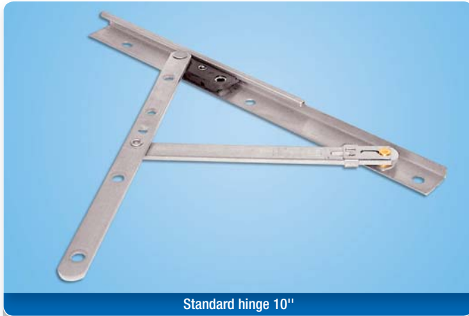
Standard hinge 10"