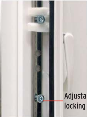
Adjustable locking cams