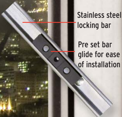
Stainless steel locking bar